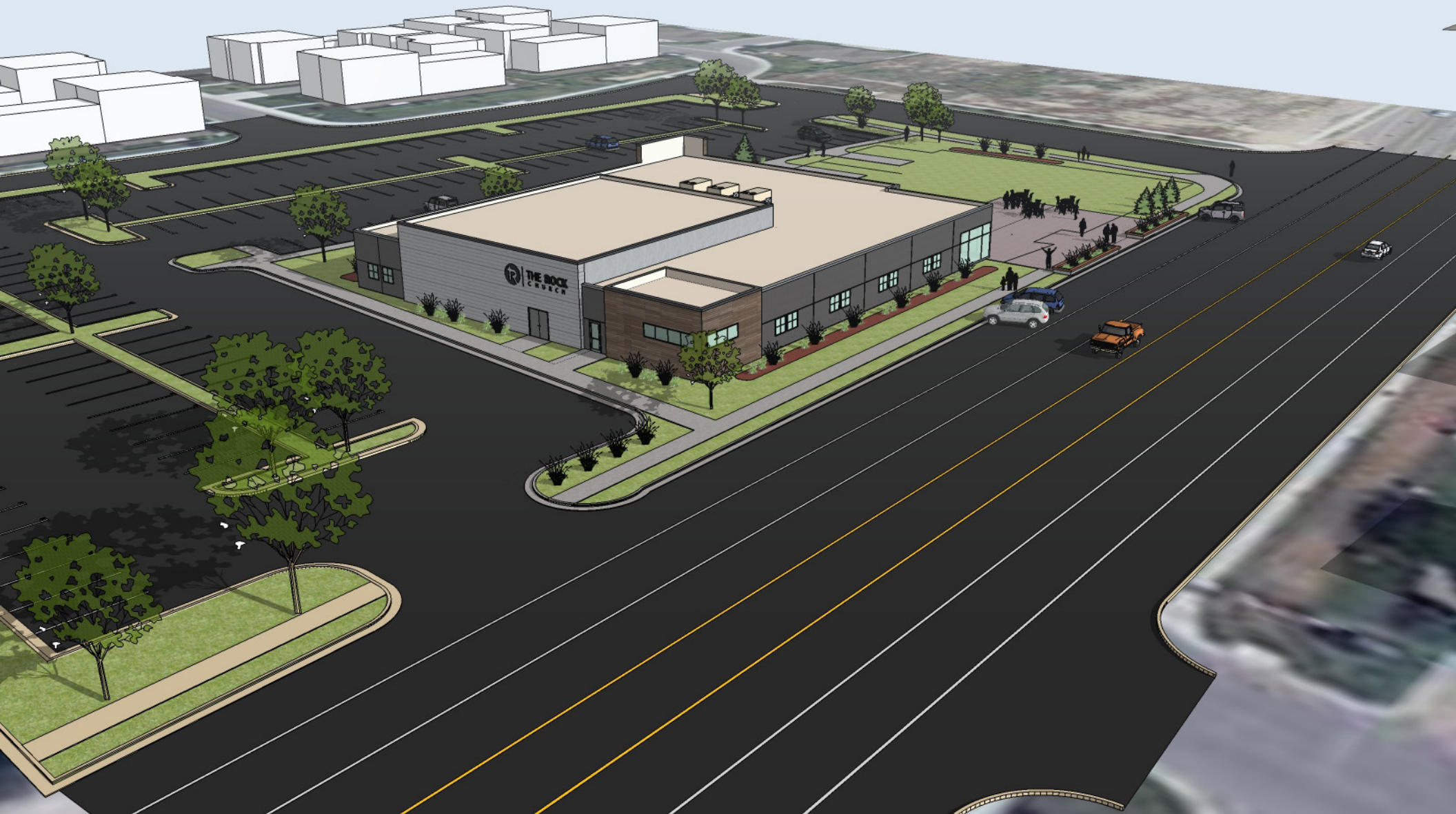
PHASE ONE NORTHWEST AERIAL VIEW