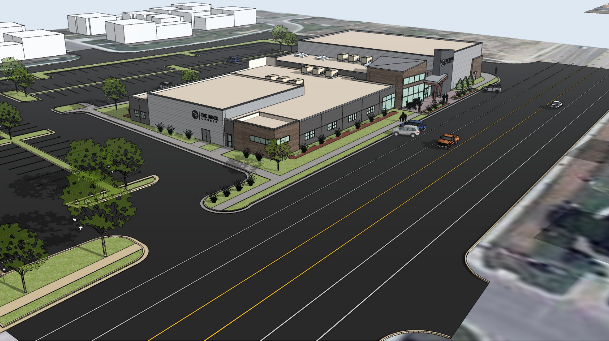
PHASE TWO NORTHWEST AERIAL VIEW